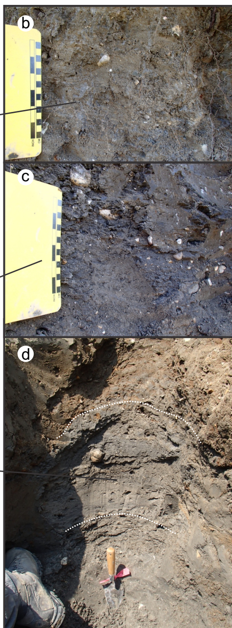
Figure 34: Photos of sediments present at section 15112TH156: a) river-view of the river cut exposing sediments; b) till exposed at 0.8 m depth; c) till exposed at 2.2 m depth; d) inter-till sediments exposed at 3.4–3.8 m depth. Upper and lower contacts with till are highlighted by the dashed white lines.